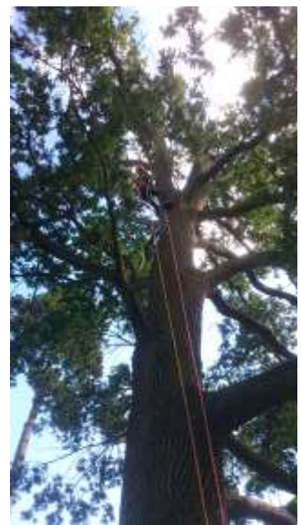
Arboriculture in Action (Royal Forestry Society)

In an increasingly computer-based world, forestry is one of the last remaining professions where at all career levels, both a practical and a theoretical understanding hold equal importance and both are often a