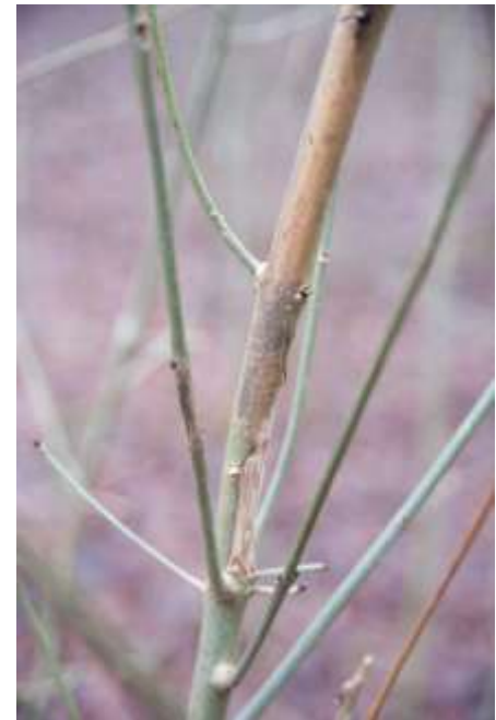
Signs of ash dieback in the twigs (Tree Council)

fundamental re-evaluation of all the practices and policies used to create and manage a landscape with nonwoodland trees in it. Through working with others and bringing together knowledge and insights across sectors, The Tree Council is playing a crucial role to ensure we act now.