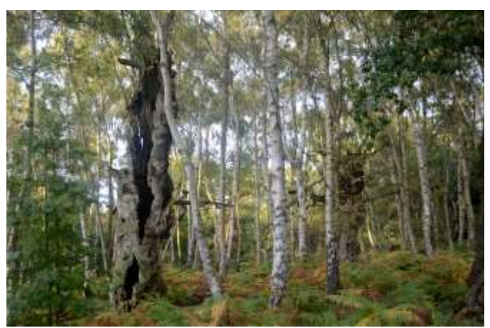
Does the land around the tree need managing? These veteran oak trees were killed by excessive shading

Threats to veteran trees often arise from the land surrounding the tree. Common examples include excessive