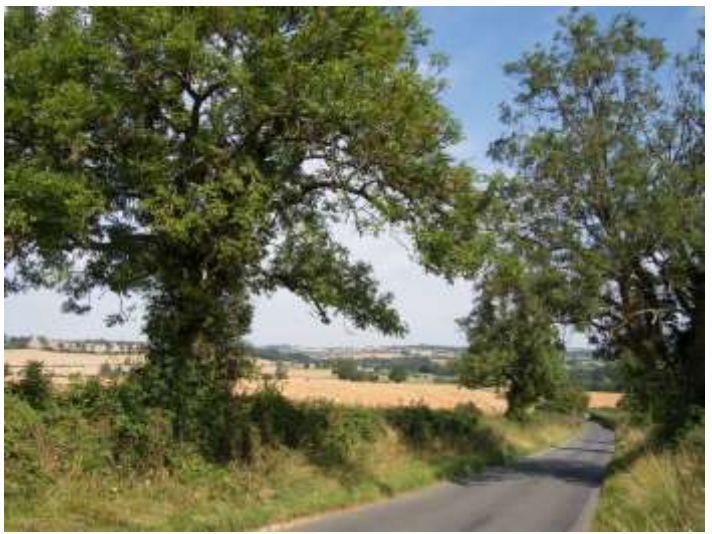
Ash landscapes - The Cotswolds (Tree Council)

Trees are vulnerable to many different threats which is why we need an ongoing national strategic approach to monitoring, caring and safeguarding trees if we are