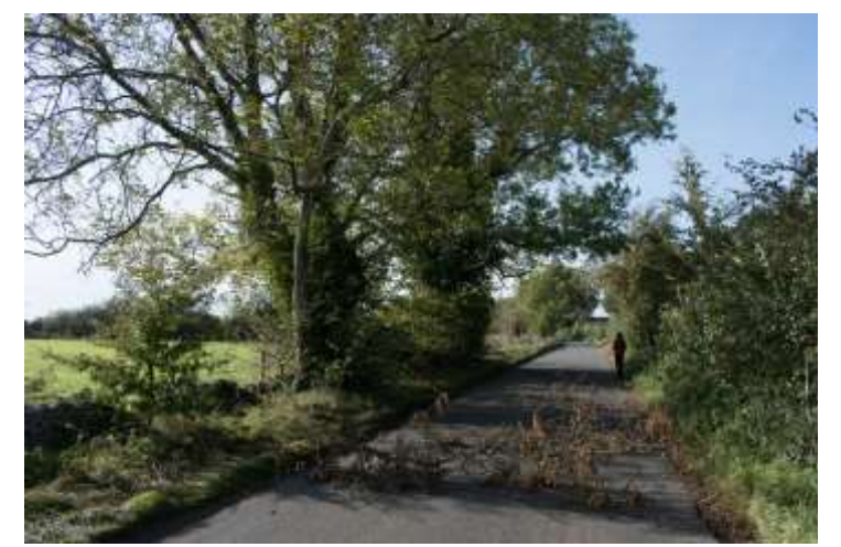
Ash trees shedding branches and increasing health and safety risks

In addition, key staff from our 150+ Tree Council member organisations have been involved in our work. Finally, we have been working closely with many local authorities across the country developing good