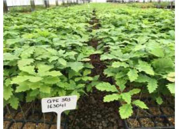
Want to create an oak forest? Well, one option is to collect acorns, propagate them in a nursery, and then plant them. But acorns from where? And how can you ensure they germinate? forestry@bangor students learn how to answer these questions, and many more!

Entry into commercial forestry typically starts with an 'assistant manager' role, whereby the assistant will provide support to a more experienced forest manager. Essential skills and qualities generally include a driving licence, high level of self-organisation, awareness of environmental, health and safety legislation, commercial acumen and numeracy. Forestry specific knowledge and expertise is also essential, including an understanding of forest operations, GIS, planning (including management planning), silviculture, forest ecology, soils, common tree species and diseases, and