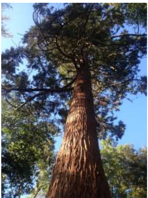
Giant redwood, Sequoiadendron giganteum. This tree might look like a giant, but at ~80 years old and 40 metres tall, it is in fact just a youngster! These trees live for several hundreds of years and are native to north-west USA.

Arboriculture is essentially a service, whereby tree