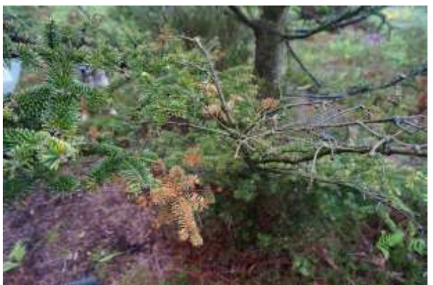
Shoot and branch dieback on fir caused by Neonectria neomacrospora

In 2015, fir trees ( Abies spp.) showing dead shoots and branches, cankers and heavy resin flow were reported to THDAS. The fungus Neonectria neomacrospora <sup>5</sup> was identified as the cause. Although records of this disease go back more than 100 years in Europe, it was in 2008 that a new and severe canker disease of firs caused by this fungus was reported in Norway. In 2011, the same disease was reported in Denmark and, in 2013, it was included in EPPO (European Plant