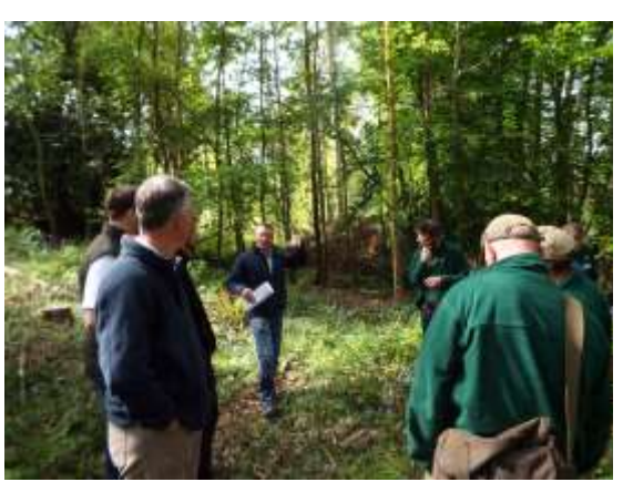
The Woodland Trust can offer advice and support for anyone interested in ancient woodland restoration.

Where they are known to be present a deer impact assessment should be undertaken and steps taken to reduce the deer population. Effective management of ancient woodland is impossible if there is a moderate to high population of deer in the vicinity. They can quickly undo any positive management, severely affecting the biodiversity of the woodland and preventing any natural regeneration of trees.