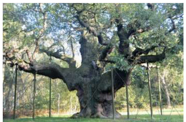
Major oak, Sherwood Forest. Reputed to be the hiding place of Robin Hood

They tell us about past land usage, which has changed dramatically in the last few hundred years, but where these trees persist they provide hints of historic landscapes. Worked trees, such as pollards, show the importance of these trees to local people in times gone by, indeed they were often vital for their very survival.