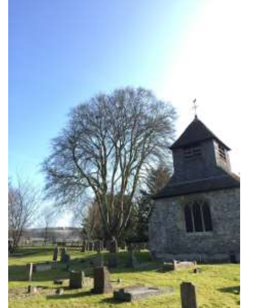
Beech tree under health monitoring in a Churchyard in Shipton Bellinger (Amelia Williams)

My day can be like a rollercoaster - very rewarding one minute to very frustrating the next. From seeing good standards of tree work being carried out, meeting new customers and sharing information on trees to frustration and emotions from people objecting to decisions about tree works or who feel upset at the way tree works were carried out.