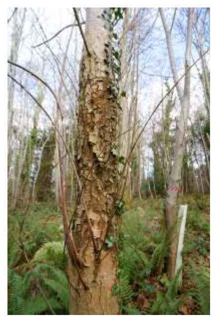
Canker caused by Cryphonectria parasitica on sweet chestnut with the characteristic epicormic growth below the canker