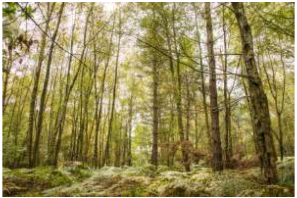
Ancient woodland: Scarce, beautiful and irreplaceable.