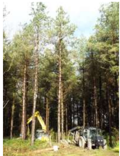
Any work should be managed carefully, particularly that involving heavy machinery.

Where ancient and veteran trees exist within and on the edge of woodlands they should be given special attention, the niche habitats within these trees are unique and can be sensitive to rapid changes in their local environment. It does not mean that management cannot take place around or near to such trees; it just means that the work should be carefully planned and perhaps phased. It is a good idea to ensure that the area around them is not append up too guidely, and that the root