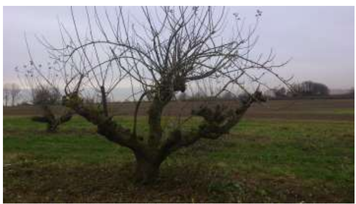
After - These Bramley's Seedlings had been heavily reduced some years ago then allowed to overgrow again. The restoration involved removing most of the clutter of growth. This probably breaks rule number one – never more than a third – but we know Bramley's are tough vigorous trees so wasn't too worried. (PTES)

heavily pruned in the late summer with little risk to its health. A rule of thumb is to not remove more than a third of the living crown in any one year. Start by reducing the length of the highest branches, or any that look likely to break imminently. In the first year this may be the only cut you make. The 'dead, damaged and diseased' rule as applied to arboricultural work is not quite right for veteran trees. The exposed canopy