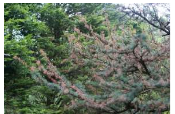
Shoot blight on Cedrus atlantica caused by Sirococcus tsugae

Protection Organization) Reporting Service as a new emerging disease<sup>6</sup>. Since 2015 the number of confirmed cases in different Abies spp. has increased.