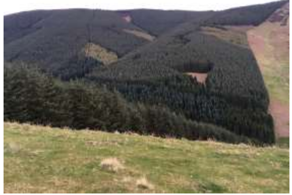
There is no doubt that the landscape impacts of conifer forests are a point of contention for many. But why were they planted in the first place? Did those who planted them really make a mistake, or were there in fact very good reasons for creating them?

somehow they might actually get paid for the privilege of working for the protection, management and stewardship of trees and forests. This short article attempts to explain some of the roles available in commercial forestry and arboricultural work. Forestry alone is estimated to employ over 43,000 people in the UK and hence there is an incredibly diverse range of roles.