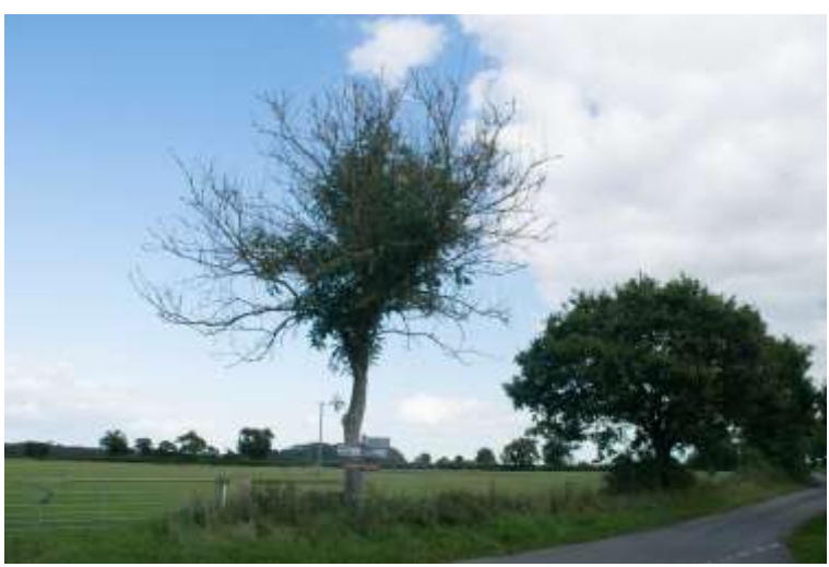
Ash Dieback affecting young hedgerow tree

In 2014 The Tree Council was asked by Defra to 'investigate non-woodland ash numbers and the potential impacts that may occur as a result of the spread of Chalara / Ash Dieback'. We have been working closely with Fera (the Food and Environment Research Agency) during this work.