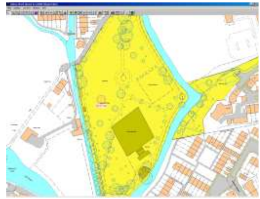
Screen shot from Ezytreev tree management database of the War Memorial Park in Romsey

My daily role includes surveying or re-surveying all the trees on Council owned land and that works out at around 26 trees per day. This entails checking for constraints, confirming landownership, making TPO applications to felling licences prior to ordering tree works and managing tree works budgets as well as putting up public notices, writing to residents and notifying the local Councillors of tree works.