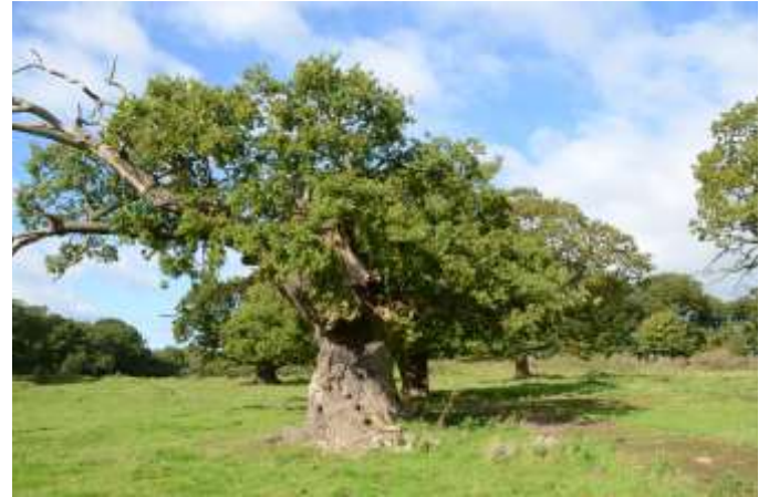
Does anything need to be done? Natural processes should be enough to keep this tree growing for years to come

Three questions can help guide the veteran tree management process; starting at number one and only moving onto the next question when the first doesn't resolve the issue.