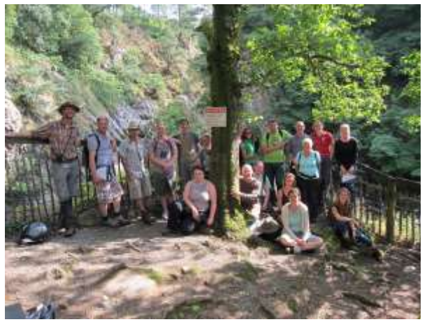
MSc students worked closely with various agencies on a study tour to complete important invasive species monitoring and condition assessment in an ancient woodland in north Wales. (Dr James Walmsley)

Arboriculture spans a wide range of roles and opportunities. Large private arboricultural businesses help organisations responsible for railways, roads and power distribution to maintain their tree resources, which in