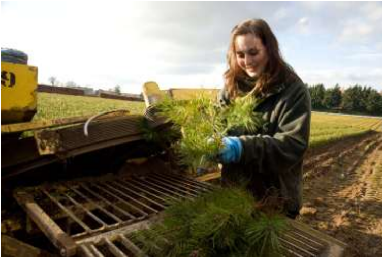
Apprentice operates machine to uproot seedlings at a nursery site

Completing an FE level course could help you enter a variety of industry roles including: countryside ranger, forestry worker, nursery tree grower, landscaper, grounds maintenance worker, arborist, local authority tree officer and self employed contractor.