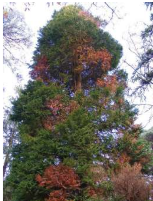
Dieback of lawson cypress due to Phytophthora lateralis

The most significant one is yet another Phytophthora , Phytophthora lateralis . This was found initially on some Lawson cypress, Chamaecyparis lawsoniana , in Balloch Country Park near Loch Lomond and another two sites nearby. Within a year it was found on trees at sites in Northern Ireland, Devon and Yorkshire. It is not known to infected trees other than Lawson cypress but on this species it always results in the death of the tree. As Lawson cypress is a very important amenity tree in Britain the implications of the disease are potentially very serious. Also as we have seen with Phytophthora ramorum there is always the possibility that it might start attacking another tree species.