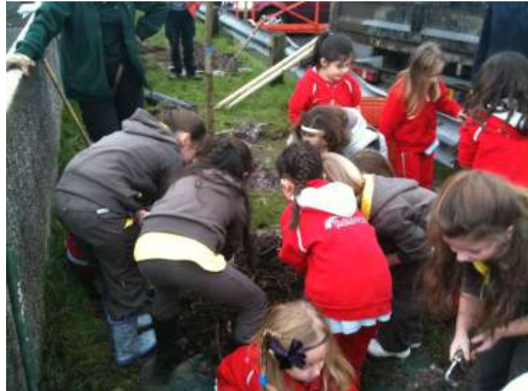
Brownies and Rainbows get tree planting with Plymouth Tree Wardens to enhance a local car park

• Visit The Tree Council's website, www.treecouncil.org.uk , for information about National Tree Week events, to publicise details of activities, for tips on tree planting and aftercare, and more about Tree Wardening, tree planting grants and Londoners Love Trees.