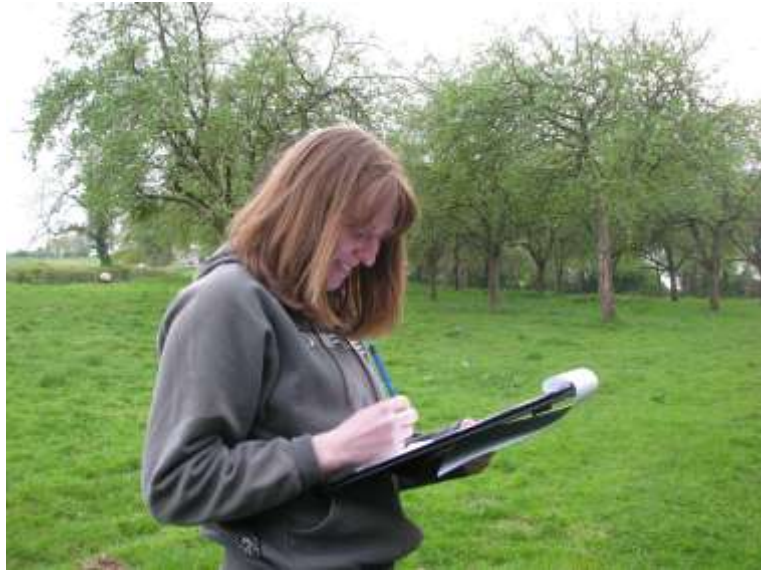
Hundreds of volunteers have helped with the orchard inventory (PTES)

to gather information from orchard owners throughout the country resulting in the collection of hundreds of orchard owner questionnaires providing valuable insights at a local level.