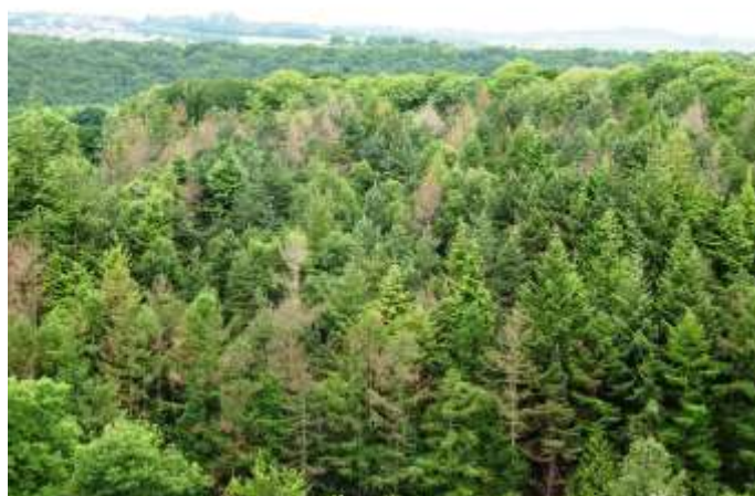
Death of larch due to Phytophthora ramorum (Forestry Commission)