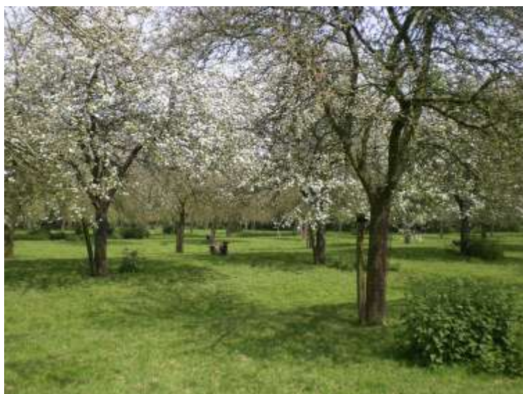
Over 35,000 traditional orchards have been identified in England (Chris Richards)

A five year research project by the People's Trust for Endangered Species (PTES) has used aerial photographs to produce a unique inventory of England's traditional orchards a UK Biodiversity Action Plan (BAP) Priority Habitat. The study funded by Natural England, the Esmée Fairbairn Foundation and PTES, has for the first time established the location, condition, age, boundaries and management status of dwindling traditional orchards to support the Habitat Action Plan (HAP) and provides a much-needed baseline of data from which to focus future conservation action.