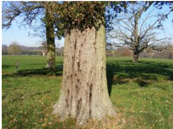
Acute Oak Decline

To summarise the earlier article, the cause of Oak Dieback is believed to be complex with a number of factors acting together or in sequence to bring about the death of the tree. We believe, however, that the main initiating factor is climatic and, specifically, repeated severe droughts. In recent years a different form of oak decline has been recognised, characterised by extensive stem bleeding and a relatively rapid decline. This new form has been designated as Acute Oak Decline while the decline mentioned above has been renamed Chronic Oak decline. Since this was written in 2009, we have continued to see an increase in oak decline, particularly the form described as Acute Oak Decline. There is now great concern about the future of oaks in some woodland sites and also in hedgerows as tree deaths have increased significantly. Research into this problem is continuing but it is likely to take several years before we have enough data to start considering ways to manage or control the problem.