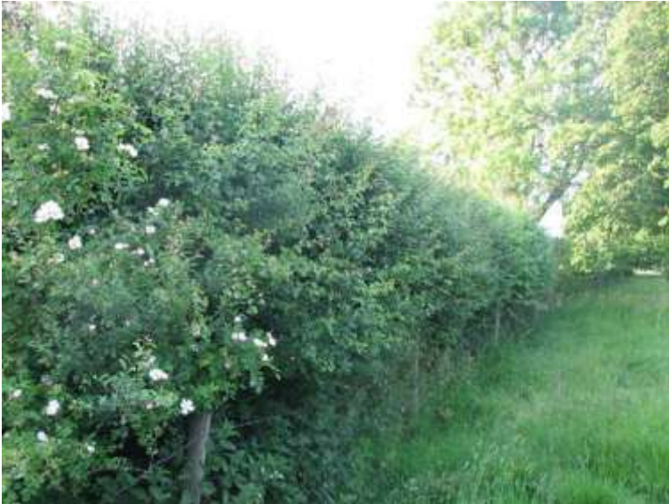
The same hedge in 2009