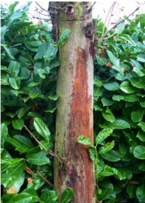
Bleeding canker of horse chestnut

With Bleeding Canker we appear to have passed the peak and the number of new cases is declining slowly. Many diseased trees have recovered from the infection and a significant proportion of the country's horse chestnuts (around 50%) seem to be resistant to the disease.