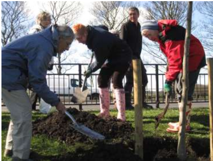
Local residents turn out to help Newcastle Tree Wardens plant new trees along one of the city’s major roads

It’s a message that the growing numbers of urban Tree Wardens are helping to spread in their own neighbourhoods. That’s why The Tree Council, which launched the national Tree Warden Scheme back in 1990 specifically to harness the power of volunteers for the good of their communities’ trees, is looking particularly to them to galvanise fellow citizens into action during National Tree Week.