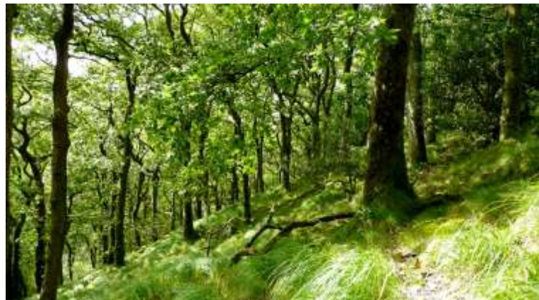
Why we should save our woods

No one involved with the forestry campaign has argued that the Forestry Commission doesn't need reform or that the PFE should be held in aspic. But what the campaign argued was that time should be spent on getting the reform right. To sell off the PFE would only bring