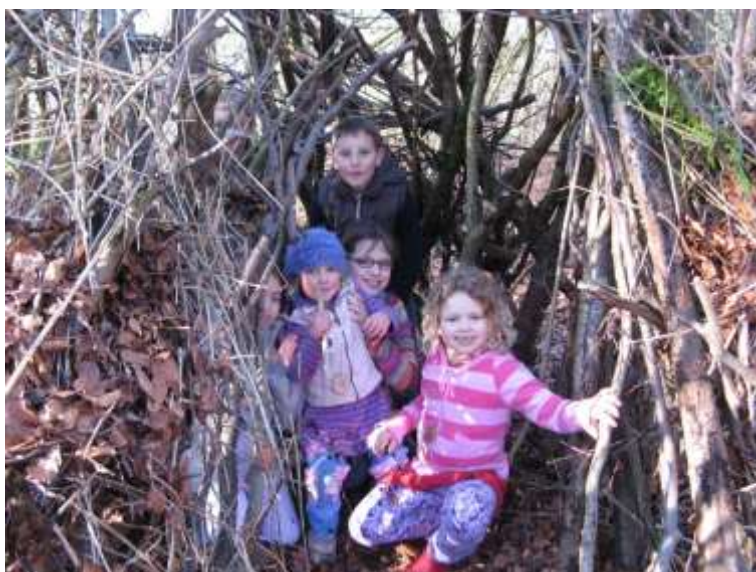
Home education families at Forest School