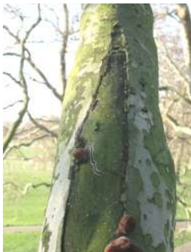
Massaria disease of London plane (Forestry Commission)

Yet another new disease, as yet not fully understood, is Massaria disease of London Plane, Platanus xhispanica . Long bark lesions form on the upper side of branches and the fungus Splanchnonema (=Massaria) platani can be found on the dead tissue. Sometimes the branch is killed but more often the exposed wood becomes decayed leading to branch failure. As these trees are widely planted in parks and roads any failure of sizeable branches is a serious problem. The disease is to be the subject of more research to establish the precise relationship between the fungus and the bark death.