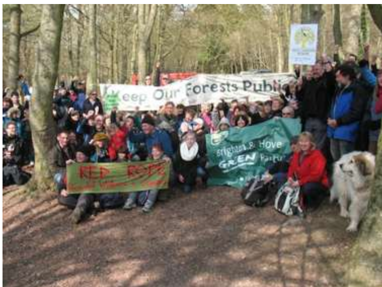
Sussex Keep Our Forests Public campaign group at their rally in Friston Forest in March 2011 (saveourwoods.co.uk)

No one can deny that the instinctive reaction by hundreds of thousands of people, including myself, to the statement that our forests were 'under threat' was to get up off our sofas and start tying yellow ribbons on