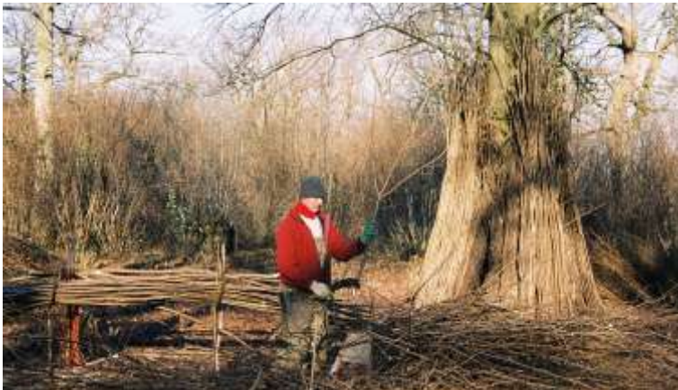
Coppicing hazel in East of England

That's the message from the RSPB which is supporting National Beanpole Week (21 – 29 April 2012). Events are being organised across the country by the Small Woods Association to highlight the plight of traditional coppiced woodlands which have declined by 90 per cent in the past century.