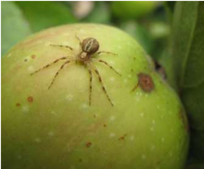
Over 1800 species of wildlife are associated with the traditional orchard habitat (PTES)

Anita Burrough, PTES Orchard Officer, who led the project team, says: "We are proud to have completed this important inventory which for the first time gives us a true picture of the state of traditional orchards. The mosaic of habitats that comprise a traditional orchard provide food and shelter for at least 1,800 species of wildlife, including the rare noble chafer beetle which relies on the decaying wood of old fruit trees. With this loss of habitat, we also face losing rare English fruit varieties, traditions, customs and knowledge, in addition to the genetic diversity represented by the hundreds of species that are associated with traditional orchards".