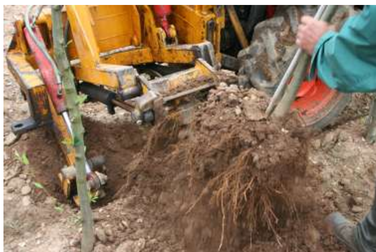
Machine-lifting bare root trees from November – March

Dependent on budget and time of year, you need to decide which tree supply options are available to you. Bare-root trees, available from November to March – the “lifting season”, when trees are dormant – are the most cost-effective and environmentally-friendly method of tree supply. Easy to offload, handle and plant, they produce a strong root system and canopy growth if planted in their right season, with numerous species and varieties available, both native and non-native. Container trees offer an extended range of varieties available all year round and increase the successful transplant rates of difficult-to-establish varieties such as oak, beech and birch.