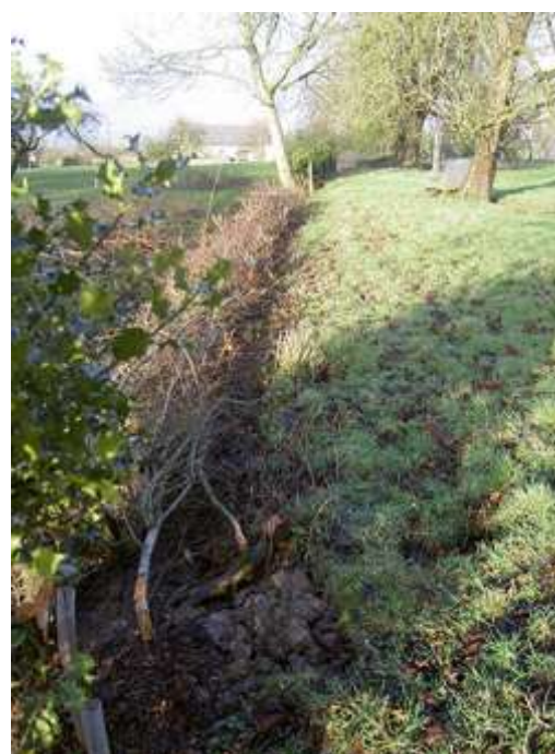
A laid hedge in 2002 (Habitat Aid)

Most woodland nurseries' conservation hedge mix is a good diverse default mix and qualifies for any grant aided planting. Nurseries will usually tweak their standard mix to your requirements. Personally I'd recommend using 60-90cm plants; they're still pretty small whips, which are easily planted and quick to establish. There is no point buying anything bigger as you'll end up with a hedge with no base.