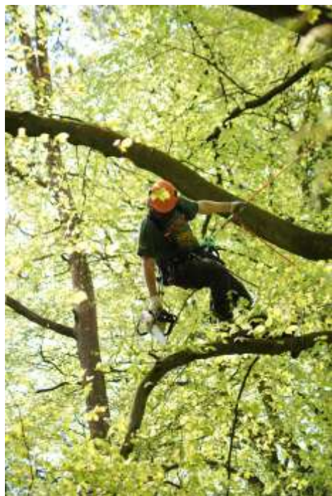
Undertaking tree care work